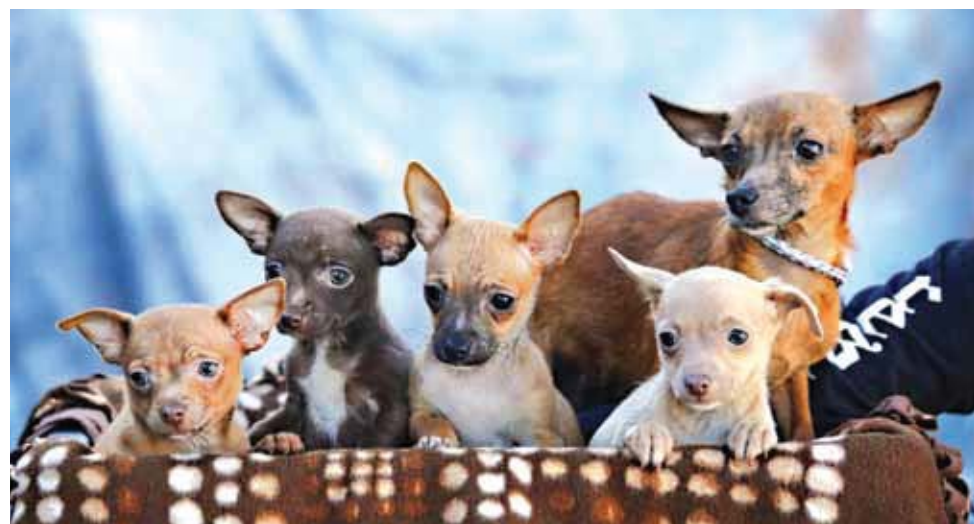
Racine and her 10 nweek old puppies.

them in his family. Gentle, loving, sweet, calm, mellow and easygoing, Connor is fabulous in every way. He was raised as an inside dog, is totally housebroken and has very good house manners. Connor walks superbly on leash and just loves to be with you wherever you are, no matter what you are doing. He would be best placed as an only dog or with another large female dog--he is not cat-safe. Remember that at 125 pounds, Connor can eat fair amount of dog food, so keep this in mind when budgeting for a new family member. Connor is neutered, current on vaccinations, has had a dental, is de-wormed, microchipped