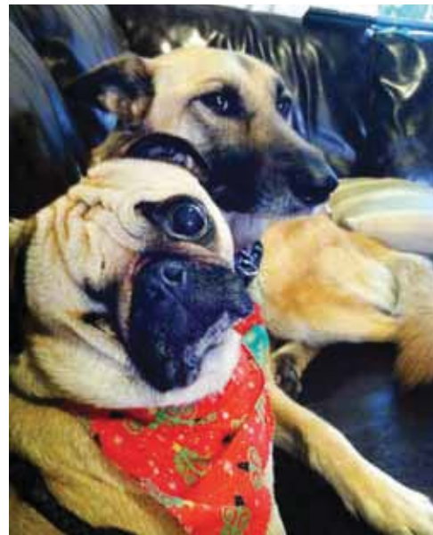
Popeye, the one-eyed dog, with his new best friend Sam.

“They make such an odd couple! But they would never notice--they truly love each other and could care less about the 40-pound